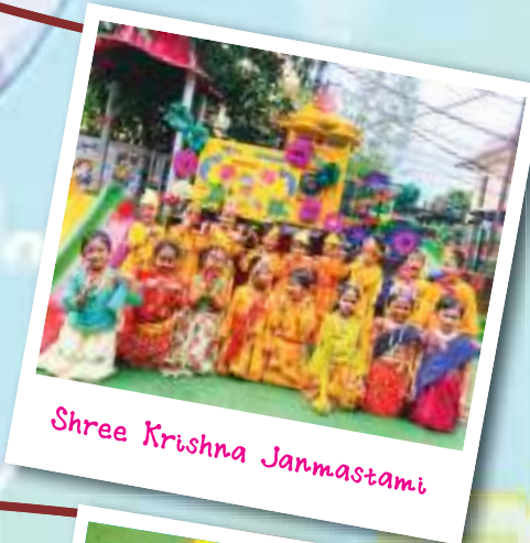
Shree Krishna Janmastami