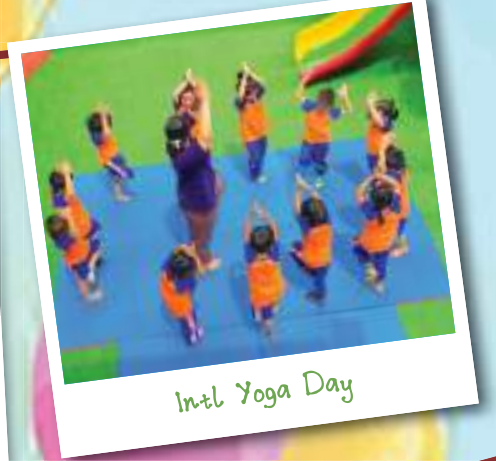
Intl Yoga Day